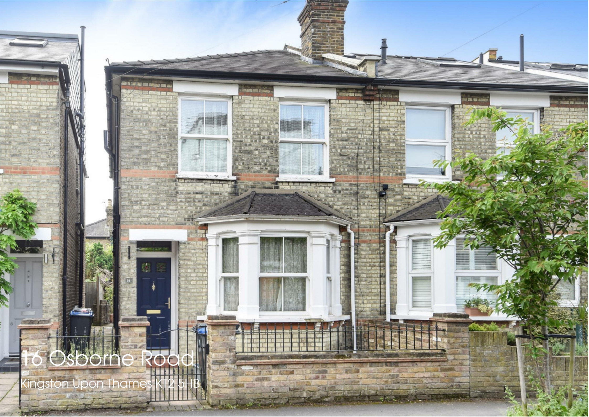
16 Osborne Road Kingston Upon Thames KT2 5HB